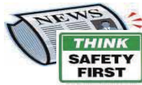
Communication & Community Safety