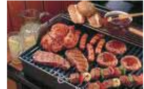
Summer BBQ & Special Events