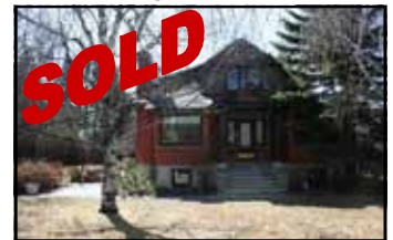
MOUNT ROYAL Offered at $3,295,000 Represented Seller