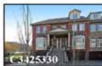
C3425330 Riverside Luxury $1,050,000