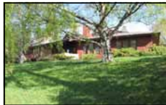
MOUNT ROYAL Offered at $1,995,000