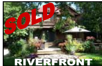
ELBOW PARK Offered at $2,975,000 Represented Seller