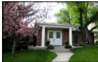
MOUNT ROYAL Offered at $1,025,000