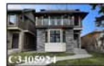
C3405924 Hilltop Vistas $899,900