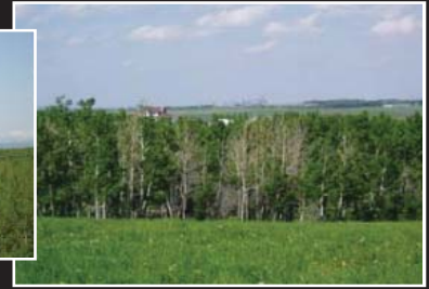
Red Deer Lake - $3,000,000