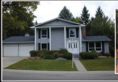
Bel Aire - $1,580,000

Ray Riley.com (403) 270-7601 • rayriley@shaw.ca