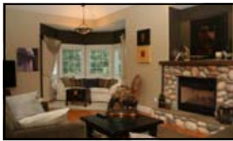
MOUNT ROYAL Offered at $1,649,900

3119 CARLETON ST. SW • Offered at $1,225,000 • Represented Seller 827 PROSPECT AVE. SW • Offered at $2,595,000 • Represented Seller & Buyer 102 CRESCENT ROAD NW • Offered at $8,000,000 • Represented Seller & Buyer