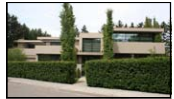
MOUNT ROYAL Offered at $6,900,000

PAST PERFORMANCE IS THE BEST INDICATOR OF FUTURE SUCCESS