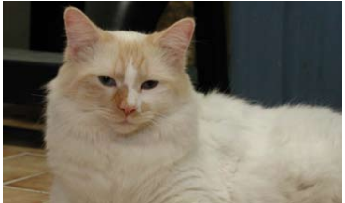
Ramsey is a wonderful, laid-back 2-year old who will fit right in with a family.

Many expectant parents worry about how their feline friends will react to their new baby and vice versa. Although new parents should take some simple preparatory precautions, there is little to fear. Problems between babies and cats are few and far between and there is no reason to assume your pet must be removed from your home when your baby arrives.