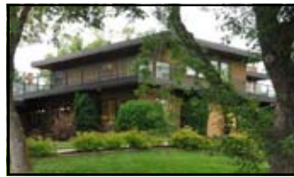
MOUNT ROYAL Offered at $2,695,000