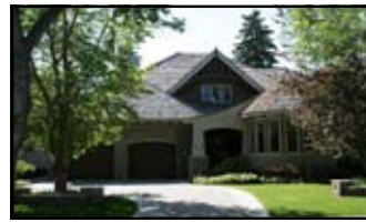
MOUNT ROYAL Offered at $5,595,000