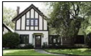
MOUNT ROYAL Offered at $2,395,000