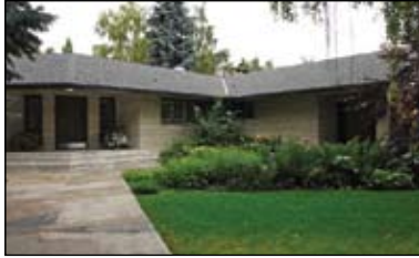
BEL-AIRE Offered at $5,850,000

A proud sponsor of the Animal Rescue Foundation - www.arf.ab.ca