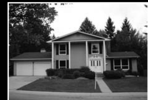
Bel Aire - $1,990,000