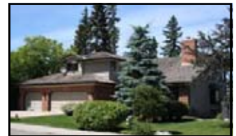
MOUNT ROYAL Offered at $2,325,000