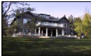
MOUNT ROYAL Offered at $4,800,000