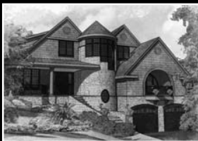
Mt. Royal - $950,000