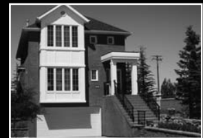
Aspen Meadows - $850,000