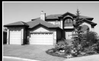
McKenzie Lake Island - $3,300,000