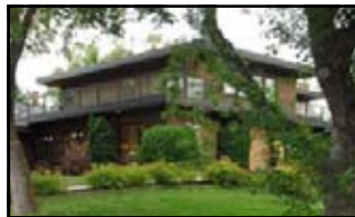
MOUNT ROYAL Offered at $3,450,000