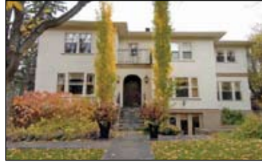
MOUNT ROYAL Offered at $3,450,000