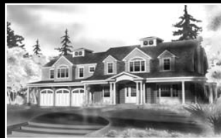
Mayfair - $1,190,000