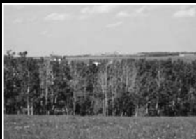
Red Deer Lake - $3,000,000