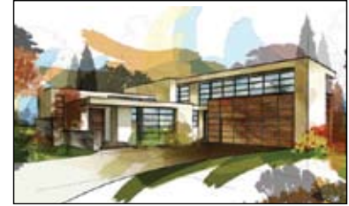
EAGLE RIDGE Offered at $3,995,000